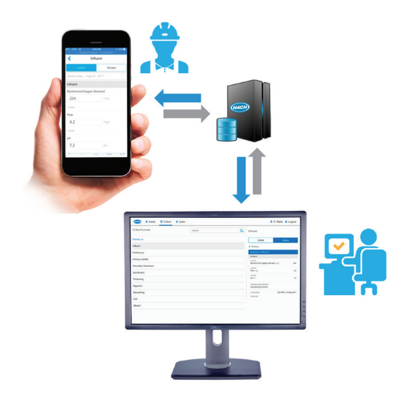
Accurate field data collection, available to authorized users, anytime, anywhere, any device.

Using Claros Collect or WIMS, authorized users can view and analyze data entered by others.